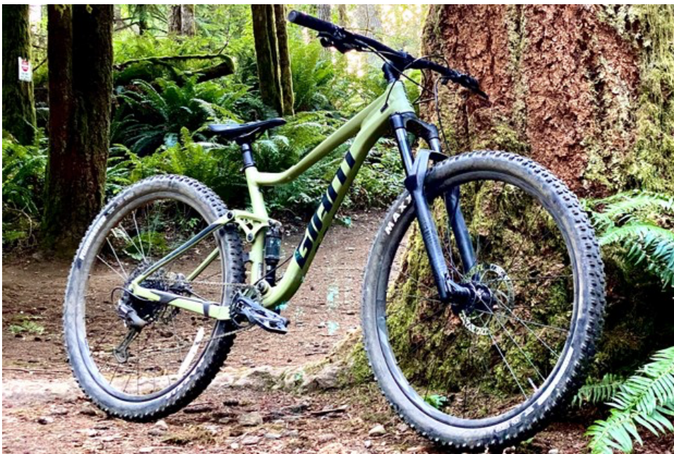
The Lemon Gulch mountain biking trail is still in the works after four years.

Grazing permits held by ranchers in the area are causing the stalemate in the trail project, though COTA says the proposed route won't encroach on grazing lands or disrupt life in Crook County.